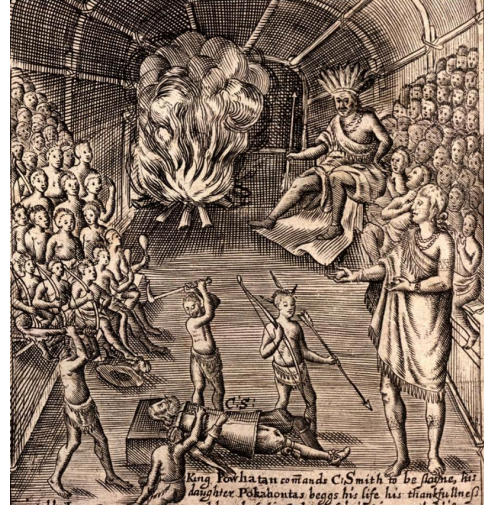
Illustration from General History of Virginia , 1624

Two days later, Powhatan met Captain Smith and said they were friends. He told Smith to bring him two guns and a grindstone and he would consider Smith his son.